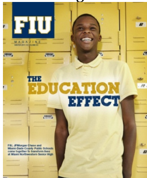
Illustration Design: Thirsty Planet